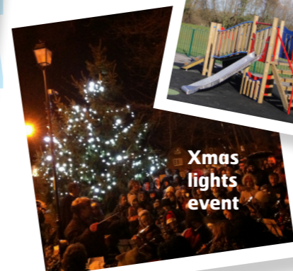
Xmas lights event